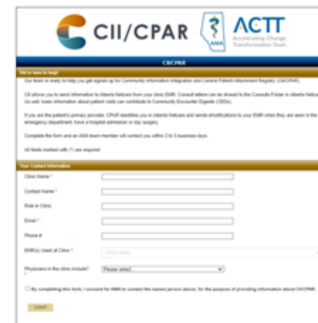
Expression of Interest