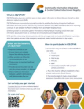
CII/CPAR Information Sheet

Complete this form to have an Alberta Medical Association team member contact you with more information.