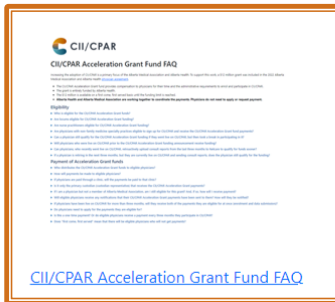
CII/CPAR Acceleration Grant Fund FAQ